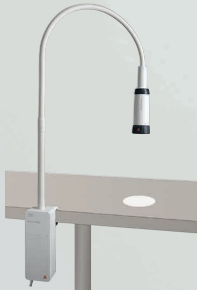
EL 10 LED Examination Light with clamp mount