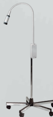
EL 10 LED Examination Light on wheeled stand, metal base

For further information please refer to: www.heine.com