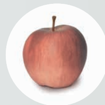
Normal LED: unrealistic colours