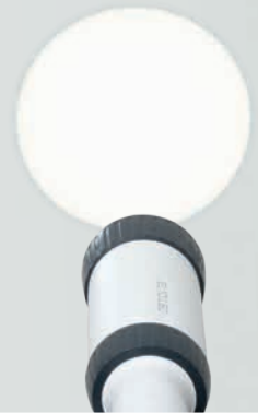
This is LED HQ : Light in HEINE Quality