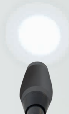
This is a conventional LED

The compact illumination head (Ø app. 60mm) allows an almost coaxial illumination, particularly in difficult application situations.