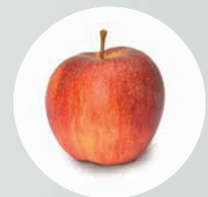
LED HQ : red is red