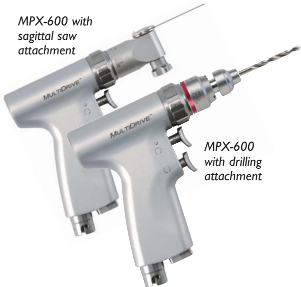
MPX-600 with drilling attachment