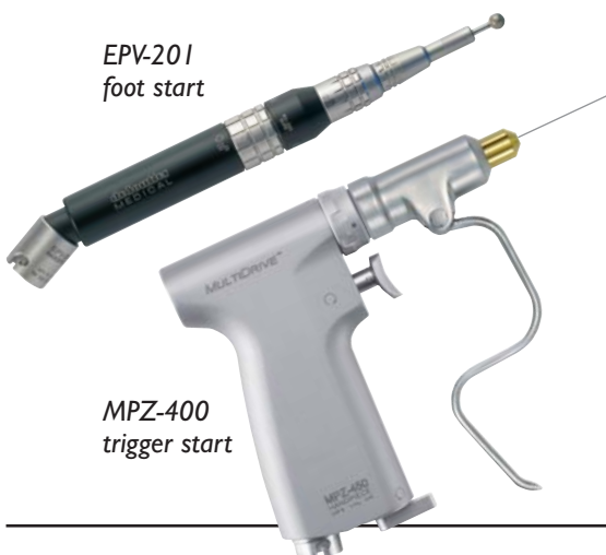
MPZ-400 trigger start